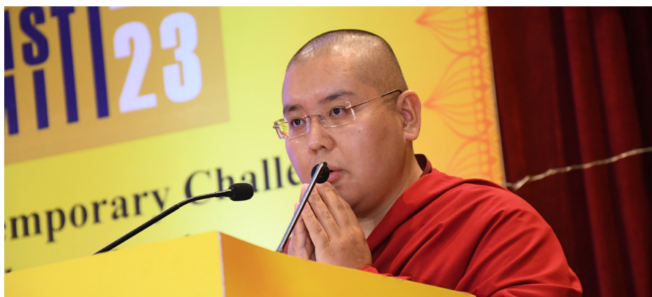
His Eminence the 7th Kyabjé Yongzin Ling Rinpoche

One should begin by seeking the inner essence of our common faith to promote the universal teachings of Buddha Dhamma. It's our responsibility to make people aware of the universal and practical teaching of the Buddha known to everyone specially the youth of today. Education should be imparted to our youth following the universal principles of Dhamma that was taught and preserved in our ancient Mahavihara like Nalanda. Prospects of the future