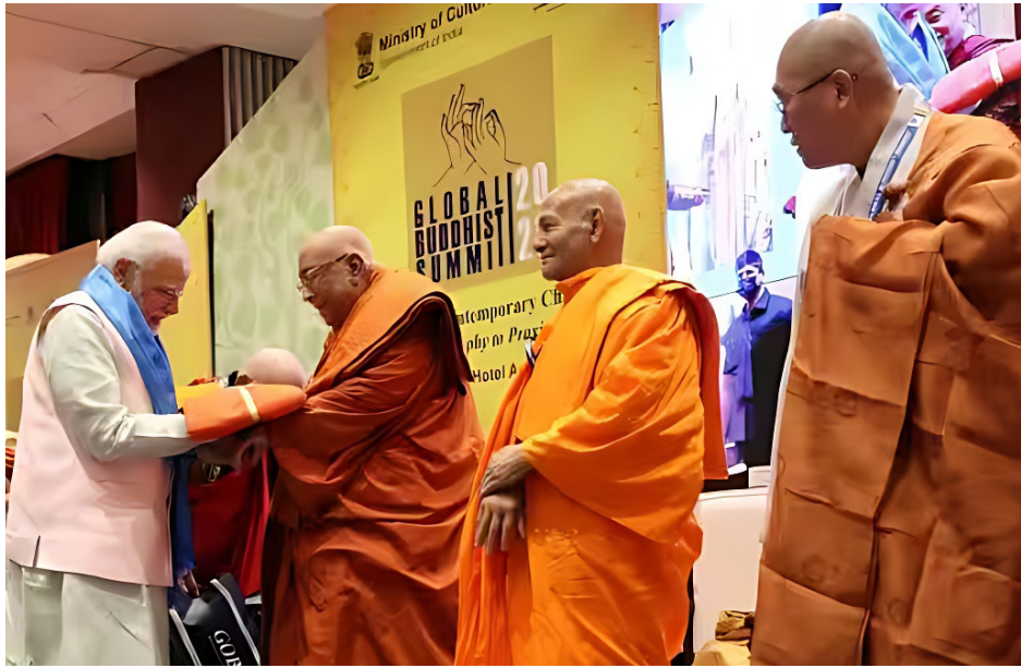
Prime Minister offering Chivara Dana to the supreme members of Holy Sangha at the Global Buddhist Summit

Buddha. For the war and unrest that the world is suffering today, the Buddha had given solutions centuries ago.