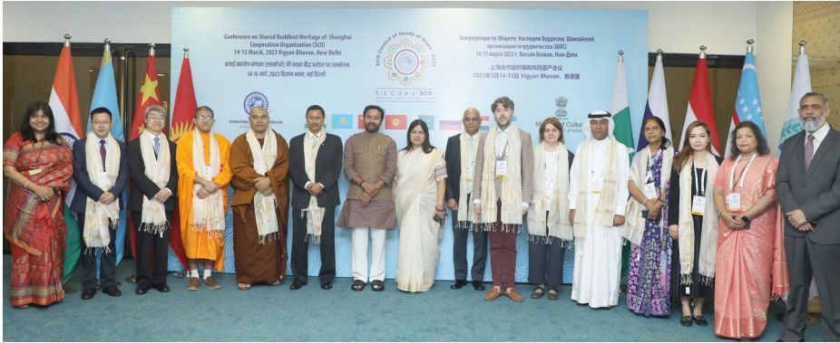
The conference was inaugurated by the Union Minister for Culture, Tourism and DoNER Shri G.K Reddy with the Minister of State for Culture and External Affairs Smt Meenakashi Lekhi and the Minister of State for Culture and Parliamentary Affairs Shri Arjun Ram Meghwal

T he focus of the Conference held on 14-15 March, 2023 at New Delhi was on India's civilizational connection with the SCO nations. The event, a first of its kind, under India's leadership of SCO (for a period of one-year, from 17 September, 2022 until September 2023) was organized by the Ministry of Culture, the Ministry of External Affairs and the International Buddhist Confederation.