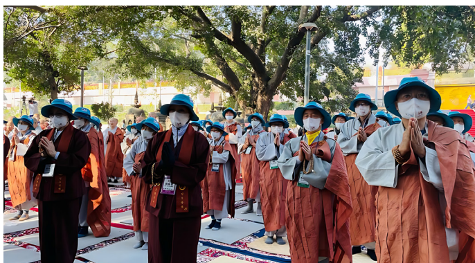
The Korean delegation of 108-monks on a pilgrimage of all the Buddhist holy sites in India, praying at the Mahabodhi complex

The convergence of the esteemed monks symbolizes the profound cultural and religious ties that have flourished over the past half-century, reinforcing the enduring bond between India and the Republic of Korea.