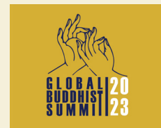
GBS logo - represents Dhammachakra Mudra or the hand gesture of the 'Wheel of Dhamma'.

In conclusion the Prime Minister said "Buddha is beyond the individual; it is a perception. The Buddha is a thought that transcends the individual. The Buddha is a thought that transcends forms and the Buddha is a consciousness beyond manifestation. This Buddha consciousness is eternal and ceaseless. This realization is distinctive."