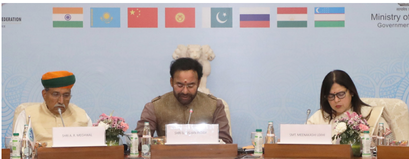
At the inauguration the Union Minister for Culture, Tourism and DoNER, Shri G.K Reddy with the Minister of State for Culture and Parliamentary Affairs, Shri Arjun Ram Meghwal and the Minister of State for Culture and External Affairs, Smt Meenakshi Lekhi