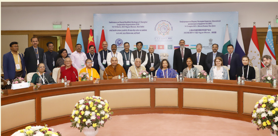
International and national participants at the Shanghai Cooperation Organization (SCO) conference

He mentioned that according to Al Beruni, Buddhism spread to Afghanistan, Iran, Iraq, Syria and Gandhara in Pakistan. He further said that there is need for SCO countries to work proactively towards creating a robust mechanism for excavation of Buddhist sites.