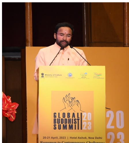
Union Minister for Culture G Kishan Reddy

He also mentioned the three Deemed Universities for Buddhist higher education and many other Buddhist institutions that have the patronage of the government, thus signifying the eminence Buddhism held in the nation's ethos and history.