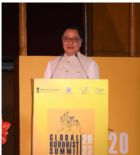
Union Minister for Law and Justice Kiren Rijiju