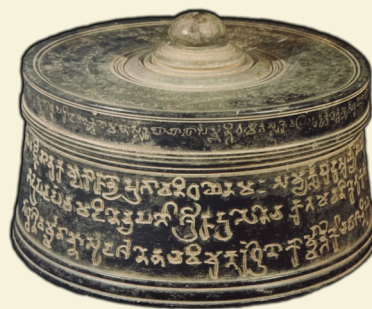
The inscribed Relic Casket, Dev Nī Morī Buddha Relics.

The excavations at the archaeological site of Dev Nī Morī were conducted by the Department of Archaeology and Ancient History of the Maharaja Sayajirao University of Baroda from 1959 to 1963.