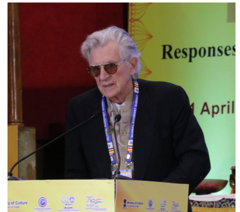
Prof Robert Thurman, Keynote speaker

Thurman mentioned the importance of Buddhists engaging in discus-