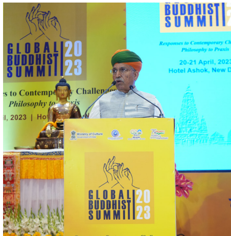
Union Minister of State for Culture Arjun Ram Meghwal

In his valedictory address at the end of the two days deliberations, Mr Meghwal referred to the several ways and means of attaining happiness as taught by the Buddha. He asked the gathering to focus on one's bare necessities rather than aspire for more. This, he emphasized was the root of all problems.