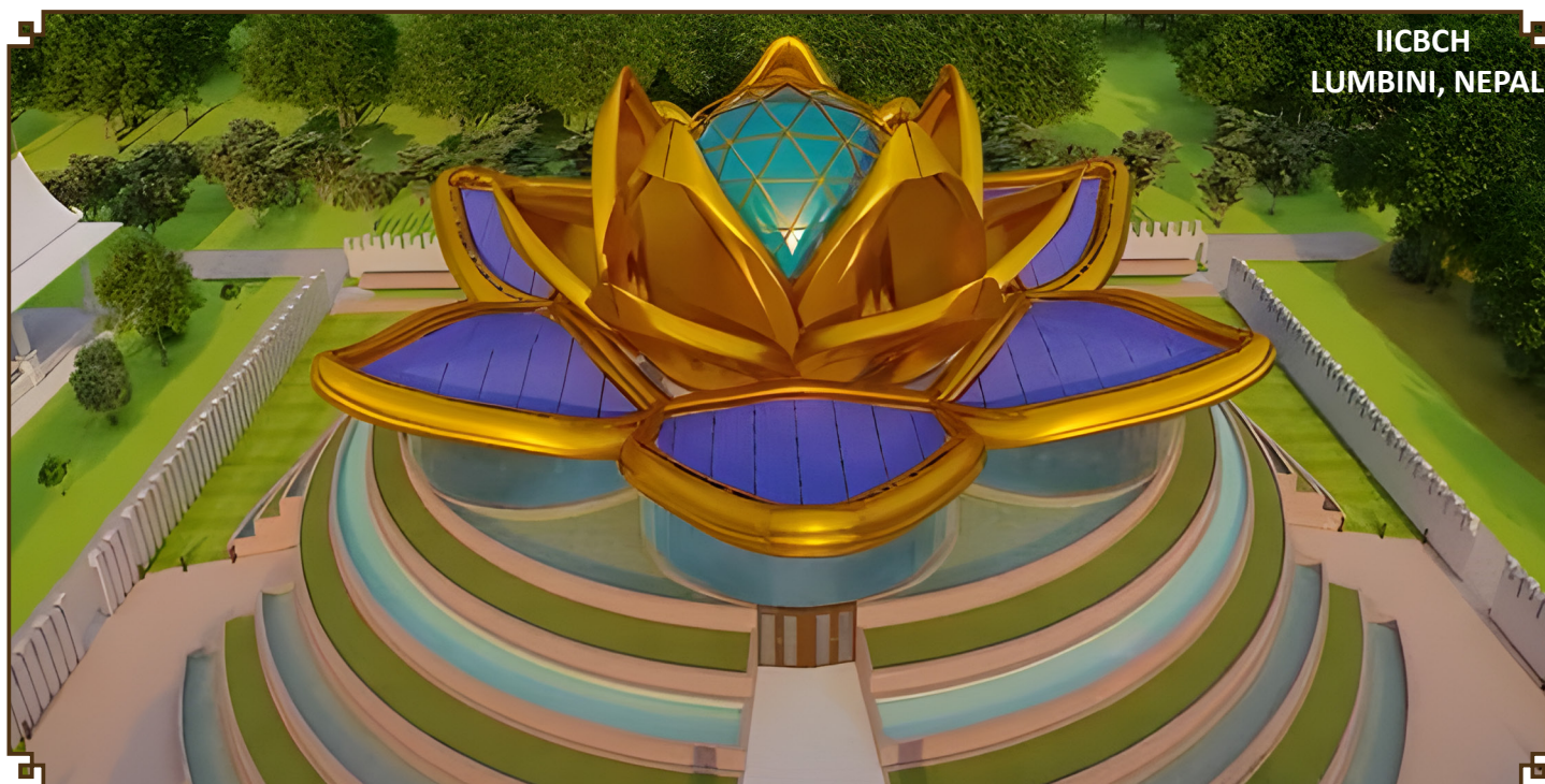
IICBCH LUMBINI, NEPAL

a sustainable environment through architecture. The centre has been conceived as a modern architectural marvel with a unique design that symbolises the essence and meaning of the lotus flower – one of Buddhism's most revered symbols of enlightenment and is considered important in the Buddhist traditions.