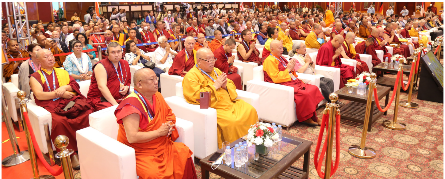
Members of the audience listening to His Holiness the Dalai Lama’s address at the Global Buddhist Summit in New Delhi, India on 21 April, 2023

He revealed that because this was a gathering of followers of the Buddha, he had shared his own experience to show that if we take our Buddhist practice seriously, pursuing deep inquiry into reality and nurturing compassion, while also refining the practices of resting and analytical meditation, it will make a difference to