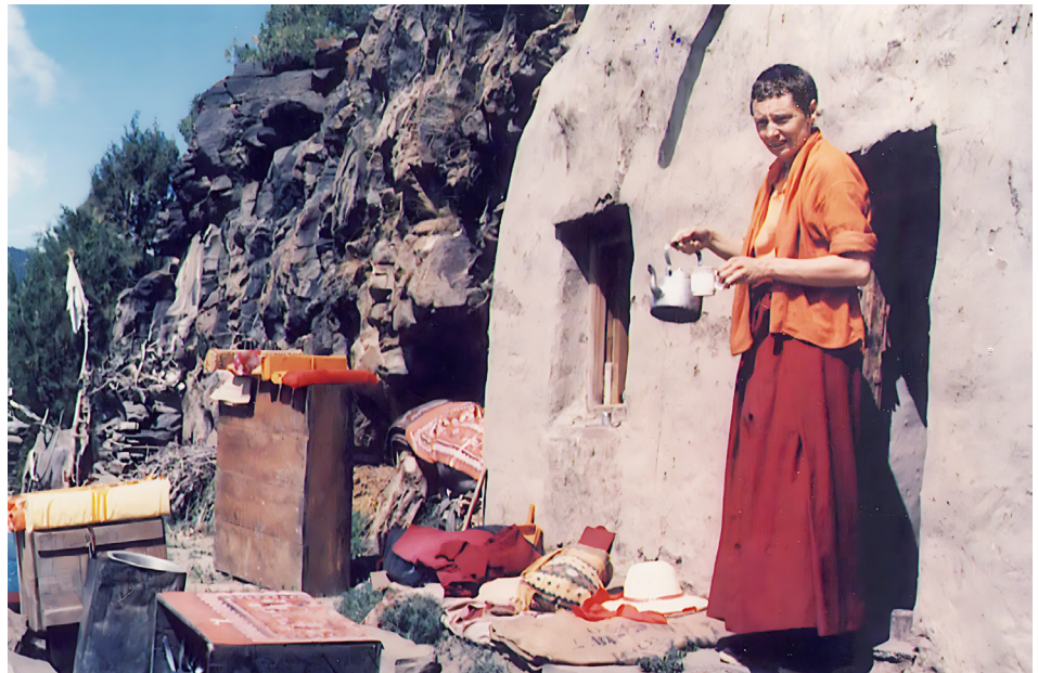
Most Ven Jetsunma Tenzin Palmo in a remote cave in the Himalayas

Most Ven Jetsunma is best known for having spent 12-years living in a remote cave in the Himalayas, three of those years in strict meditation retreat. The talk gave a historical perspective and traced the history of educating the Himalayan Buddhist nuns within the Nalanda tradition. Excerpts from the paper: