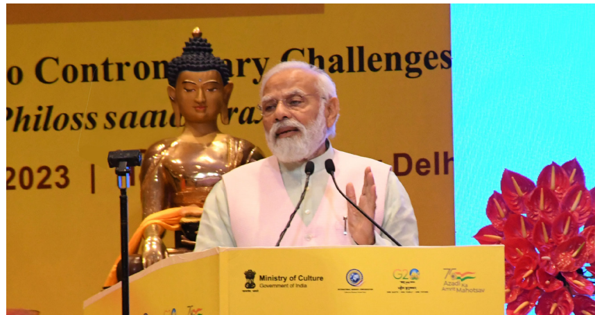
Prime Minister Narendra Modi addressing the inauguration of the Global Buddhist Summit (GBS) in New Delhi on 20 April (Thursday) 2023

"The teachings of the Shakyamuni Buddha are the basis for solutions to the greatest challenges confronting the world today, including war, economic instability, terrorism and climate change," Prime Minister Narendra Modi said at the Global Buddhist Summit (GBS) on 20 April 2023 at New Delhi.