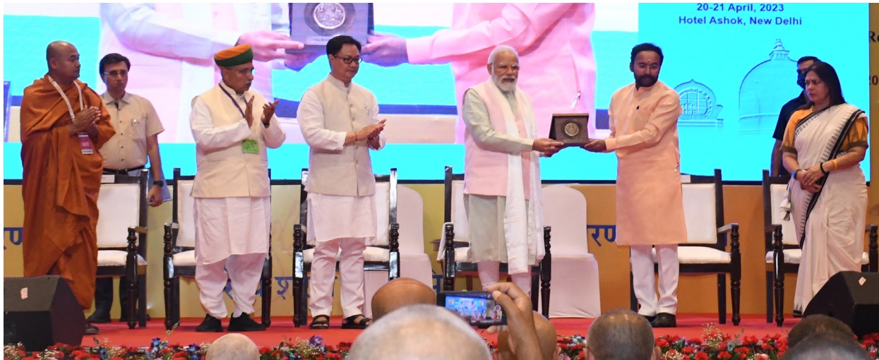
Union Minister for Culture, Mr G Kishan Reddy presenting a memento of the Nalanda seal to Prime Minister Narendra Modi